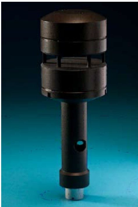
采用声共振技术的FT702LT型风传感器 FT702LT Wind Sensor using Acoustic Resonance